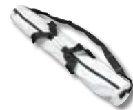
Throw Soft Carry Case